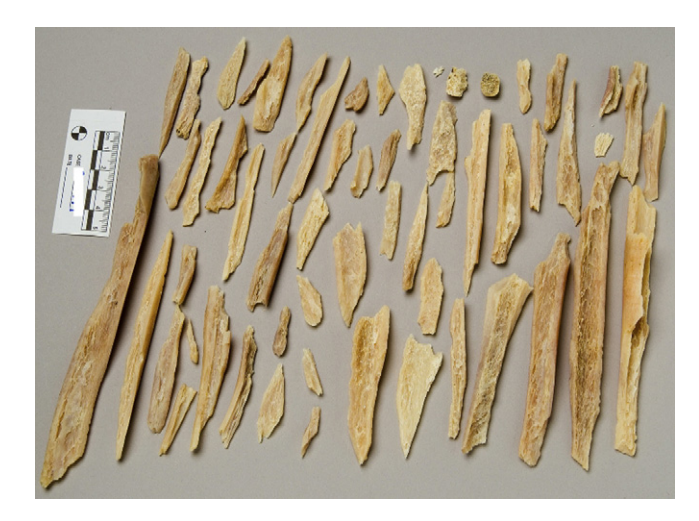
Fig. 4. Nearly 60 long bone splinters were recovered from the living room floor.