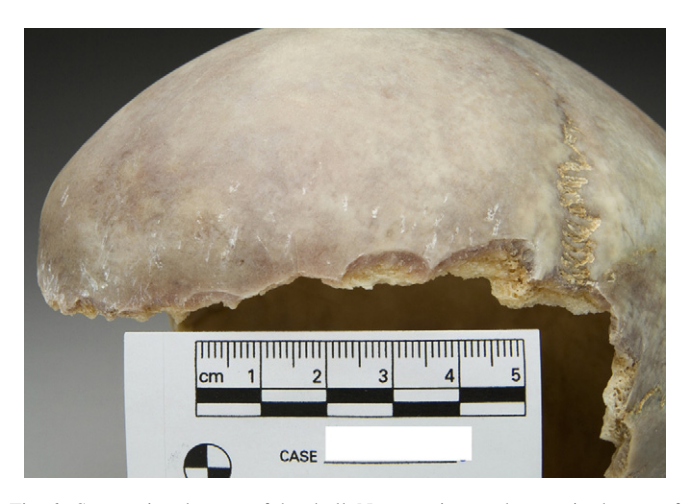
Fig. 6. Scavenging damage of the skull. Note scoring on the anterior bosses of the frontal bone.

The recovered bones displayed evidence of canine scavenging in the form of punctures, furrows, pits and scoring [1]. All of the free edges of the calvarium demonstrated gnaw marks and scoring was present along the contours of the vault (Fig. 6). All of the long bones present were scavenged and, with few exceptions, modification was confined to the ends. Most of the long bones were splintered and all exhibit scoring, furrows and/ or gnaw marks at the free ends (Fig. 7). Some bone fragments were found in the dog feces. Given the few skeletal elements