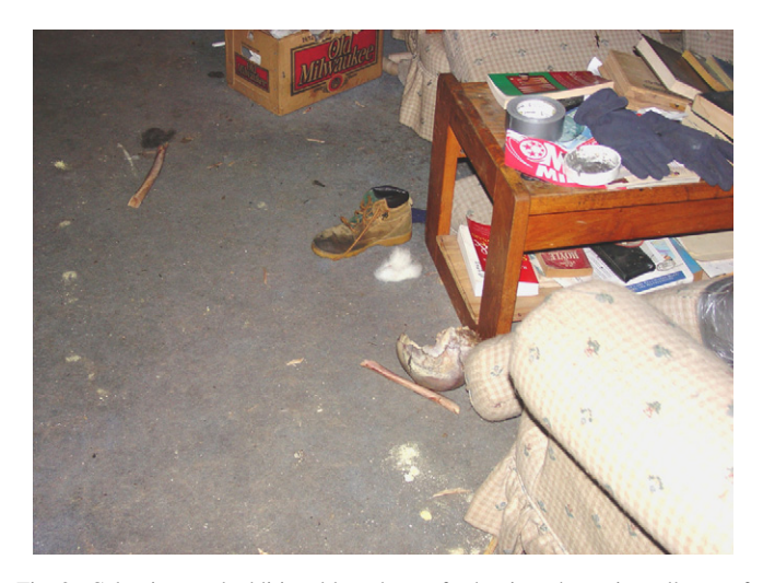
Fig. 2. Calvarium and additional long bones further into the main walkway of the living room (photo courtesy of Chenango County Sheriff's Office).

The construction of a complete biological profile, consisting of age, sex, stature, ancestry and antemortem pathologies, was not possible in this case given the sparse amount of skeletal remains available. Ancestry and stature could not be estimated due to the lack of the facial skeleton and long bone ends, respectively. The only diagnostic indicators of sex were the nuchal crests, which were not well developed, and the thin and gracile long bone diaphyses. These indicators suggested female sex. There were no epiphyses available but the length and structure of the long bones suggested adult. The ectocranial Lambdoid, Sagittal and Coronal sutures exhibited significant closure following the scoring system of Meindl and Lovejoy [8], while the endocranial sutures were obliterated. This suggested a broad age range of 30–60 years. The bones were gracile and small, indicating a petite individual.