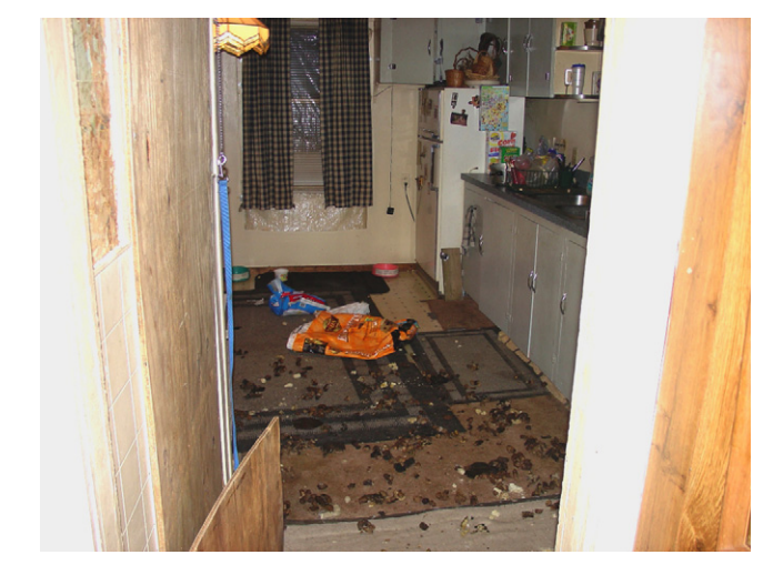
Fig. 3. Nearly empty bags of dog food as well as dog feces on the kitchen floor. Note untouched boxes of cereal on the counter.

The anthropological goals were to provide evidence of personal identity, analyze evidence of perimortem and postmortem trauma, and estimate the postmortem interval. Recovered skeletal remains included only an intact calvarium (skull vault), tibial and femoral diaphyses, and approximately 60 long bone splinters (Fig. 4). Only the femoral shafts contained a small amount of ligamentous attachments while the rest of the bones were devoid of soft tissue. There were no