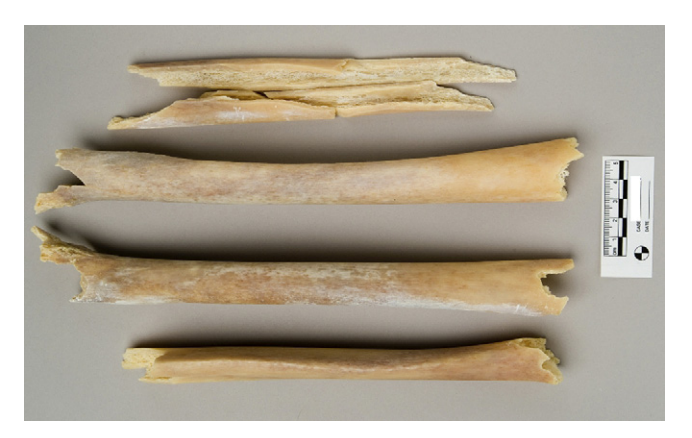
Fig. 7. Scavenging damage of the long bones. Note absence of epiphyses and scooping out of trabecular bone of the metaphyses.

recovered it appeared that the consumption of the body was nearly complete.